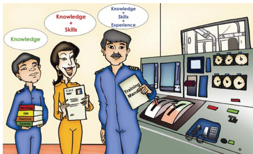
Making the difference

In fairness, there are owners, managers and manning agents who invest in the education and training of their mariners to beyond the minimum criteria set out within the STCW Code - but are they in the minority?